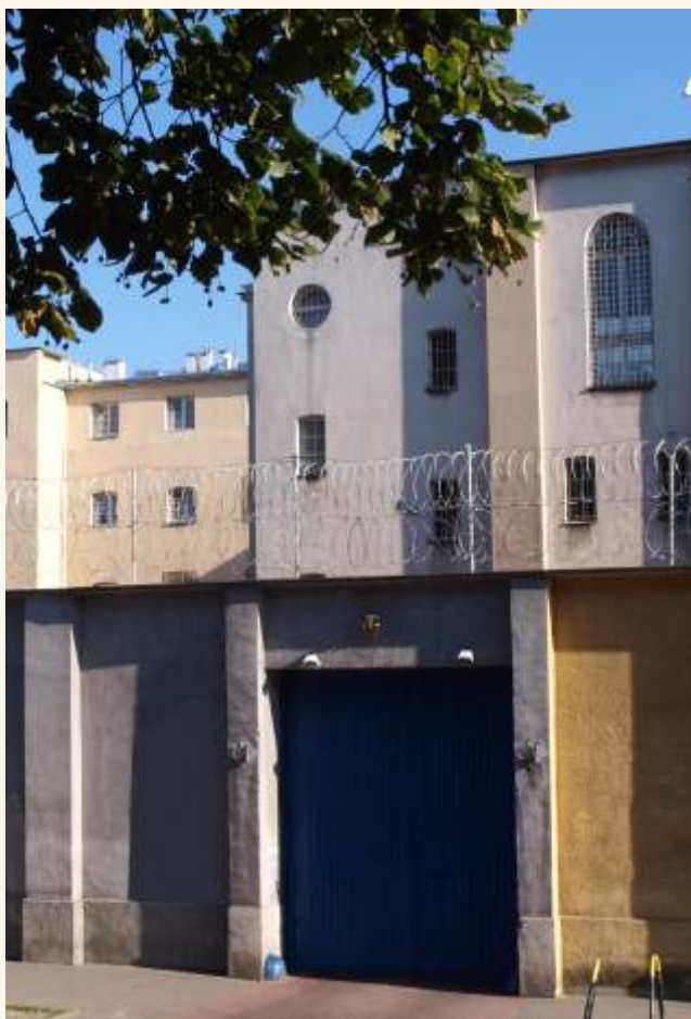
► The gate to the detention centre Warszawa-Mokotów, the modern view

communist authorities. Elżbieta Zawacka also painfully felt „freedom”. On 5 September 1951, the officers of the Public Security Office (Polish political police) knocked on the door of Elżbieta Zawacka’s flat in Olsztyn. They searched the flat, destroying and requisitioning many research materials, and arrested her.