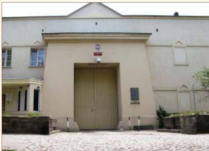
▲ The gate to the prison in Grudziądz, modern view

kept in a cell with eight other prisoners. She went through a ruthless investigation. Accused of harmful activities for the Polish state, she was sentenced by the Military District Court in Warsaw first to 5 years in prison (sentence of 23 January 1952), and after the review of the verdict – at the request of the military prosecutor's office – upon the decision of the District Court – for 7 years (28 July 1952). After another review, she was sentenced to 10 years in prison (28 November 1952). On 12 December 1952, after a year and a half of