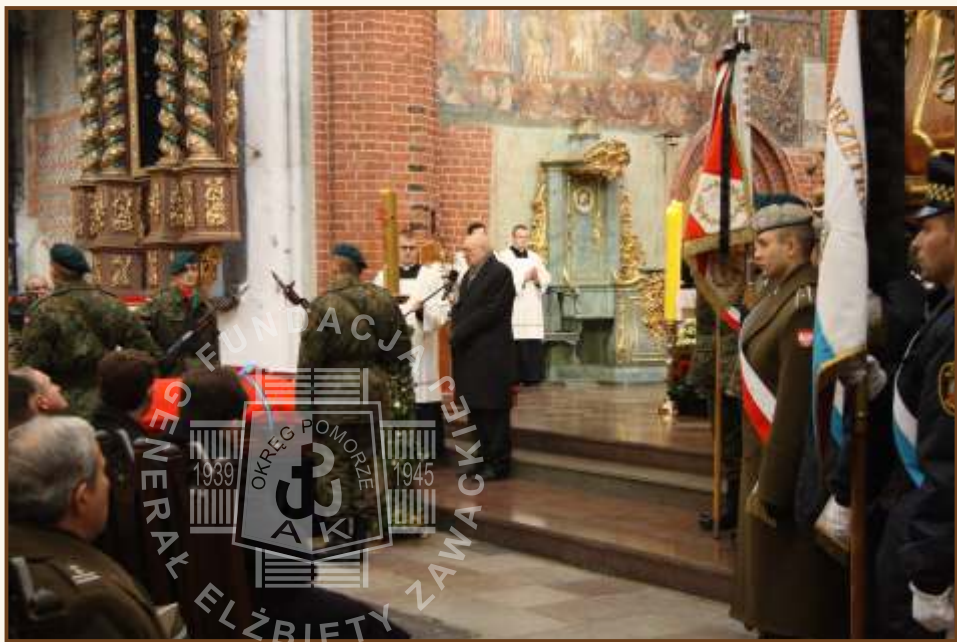
▲ The funeral mass service of Gen. Elżbieta Zawacka. Władysław Bartoszewski speaking, Toruń 17 Jan 2009