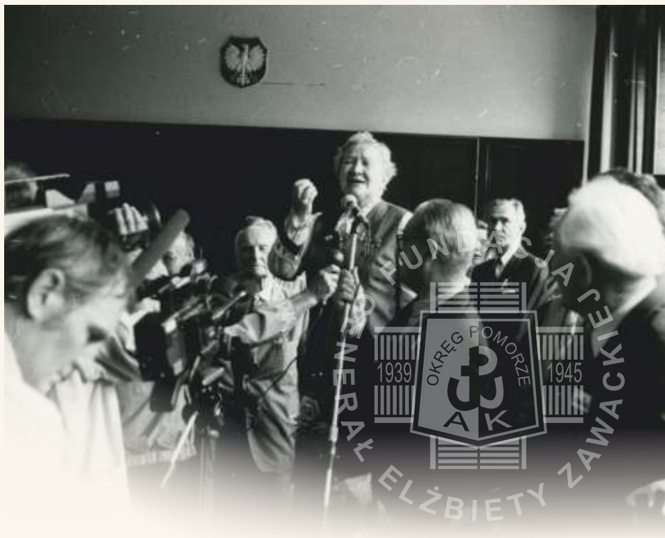
▲ The establishment of the Association of Soldiers of the Home Army, the building of the court, Warsaw 1989