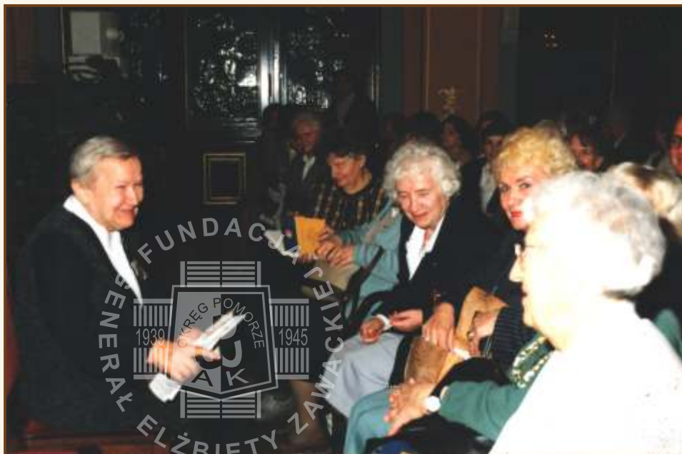
▲ The 1st Assembly of Women Soldiers