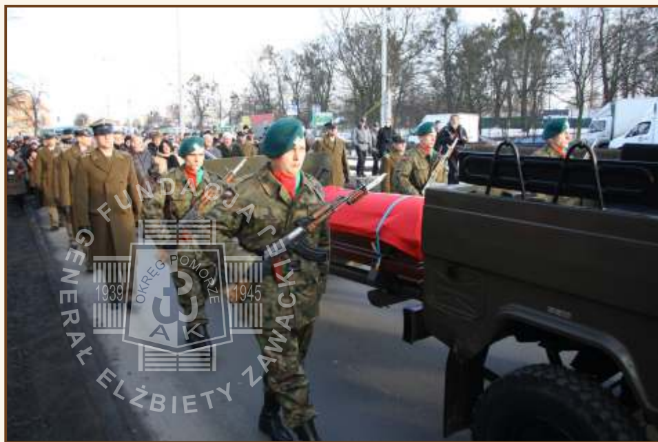
▲ Funeral procession of Gen. Elżbieta Zawacka, Toruń 17 Jan 2009