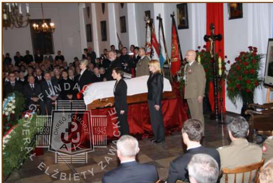
▲ Honour guard at the coffin of Gen. Elżbieta Zawacka, Toruń, 17 Jan 2009

engaged a large number of people to realize her ideas. With her charisma and faith she was able to motivate both young people and veterans to work. Anyone who was lucky enough to meet her at least once will always remember her and her faith in the sense of her actions for the good of her homeland. She passed away a few weeks before her hundredth birthday, on Saturday morning on 10 January 2009 in Toruń. She was buried with honors due to the General of the Polish Army in the cemetery of Saint George in Toruń (Gałczyńskiego Street), where over three thousand people came to bid farewell to her. Her legacy is the Foundation, which from 9 March 2009 is called the Foundation General Elżbieta Zawacka. The Archives and Museum of the Pomeranian Home Army and the Women's Military Service . The foundation accomplishes the goals which Gen. Elżbieta Zawacka set to her employees and volunteers years ago.