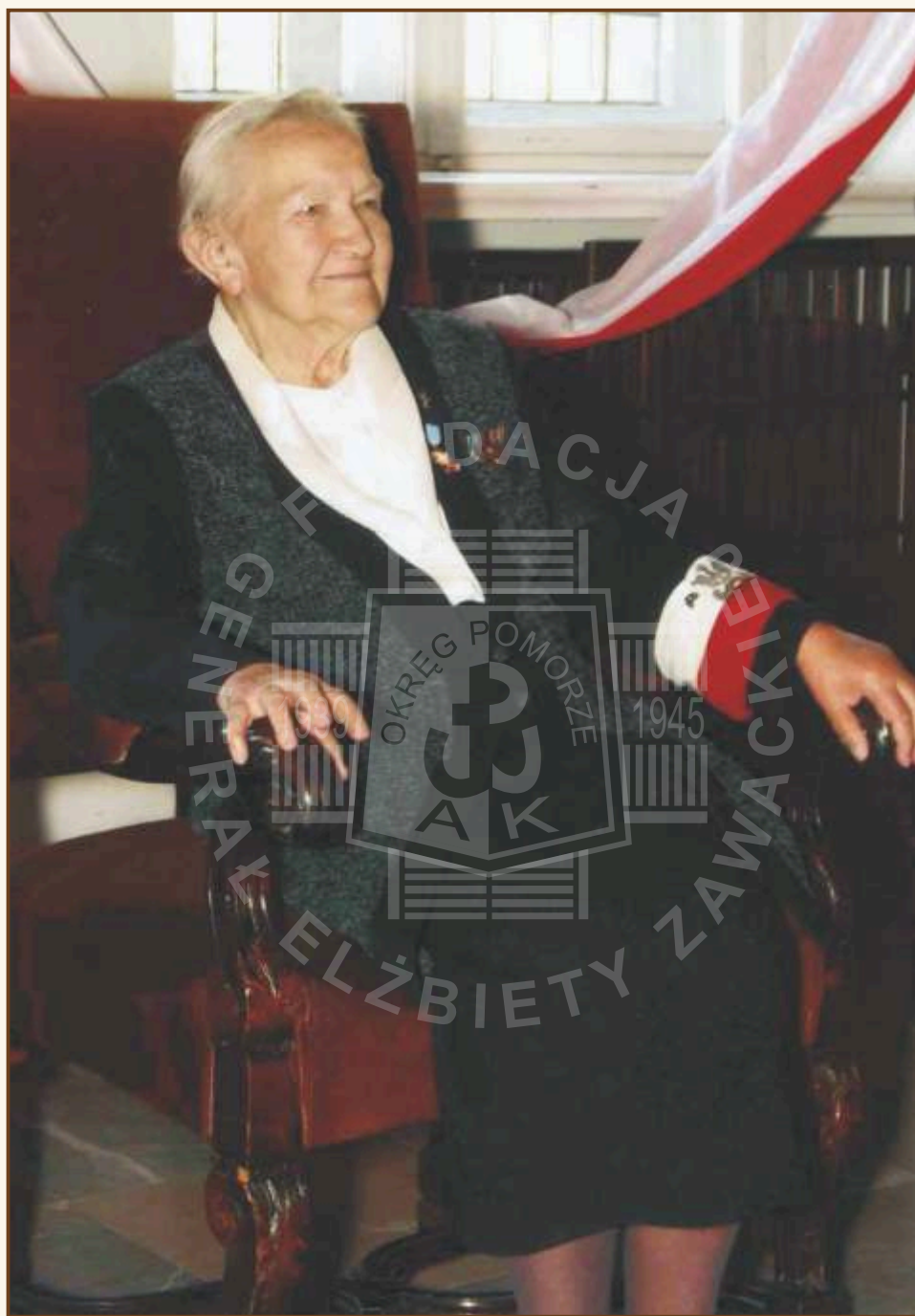
▲ Elżbieta Zawacka during the ceremony of the nomination to the rank of brigadier general, Toruń 2006