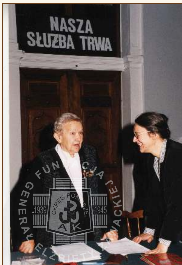
◀ The 2nd Assembly of Women Soldiers