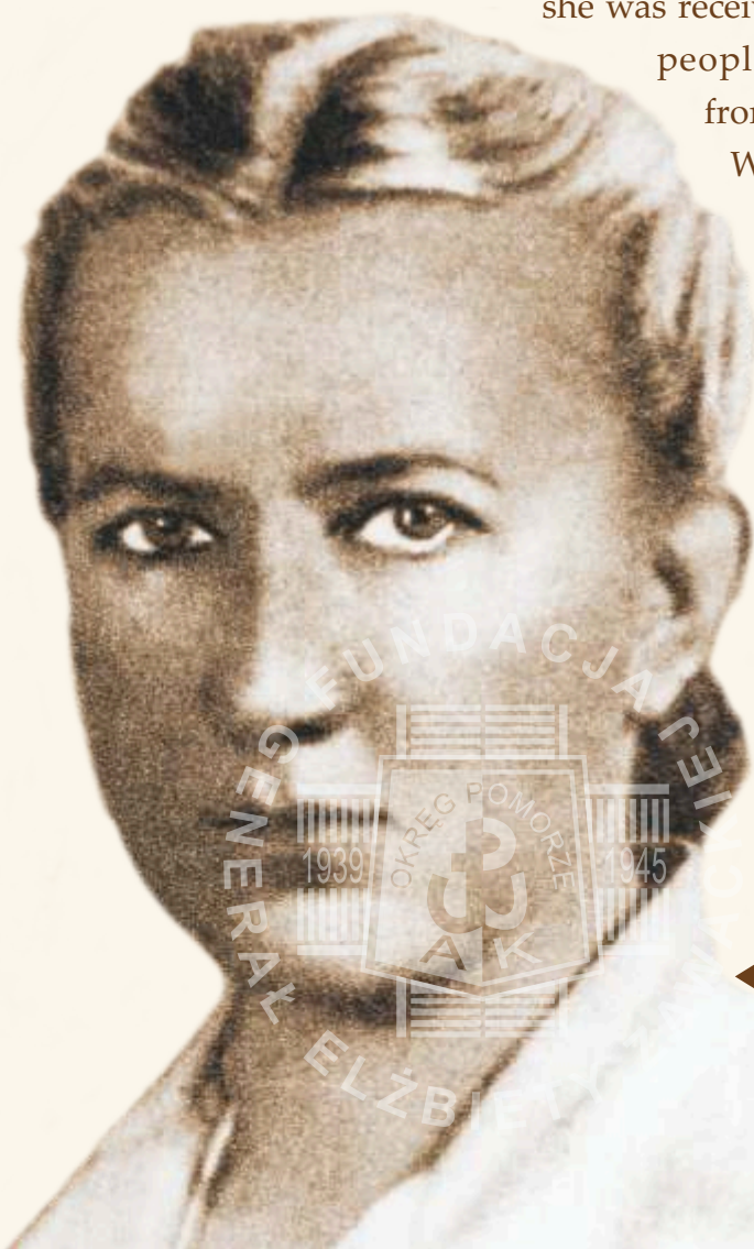
◀ Captain. Elżbieta Zawacka, 1944