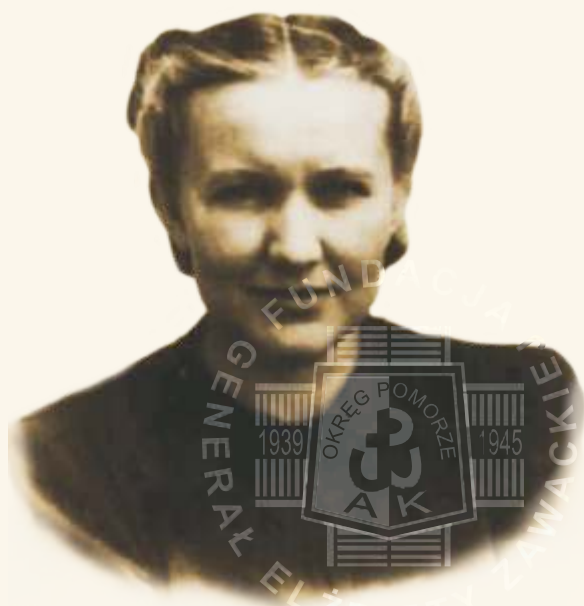
▲ Elżbieta Zawacka in 1943

In the courier and organizational work of Elżbieta Zawacka, the old contacts with her female school mates from the so-called High School of Raciborzanki in Tarnowskie Góry were invaluable. Also, Zawacka, who worked in the Silesian structures of the Military Women's Service [Polish: Wojskowa Służba Kobiet – WSK], was also involved in the work in