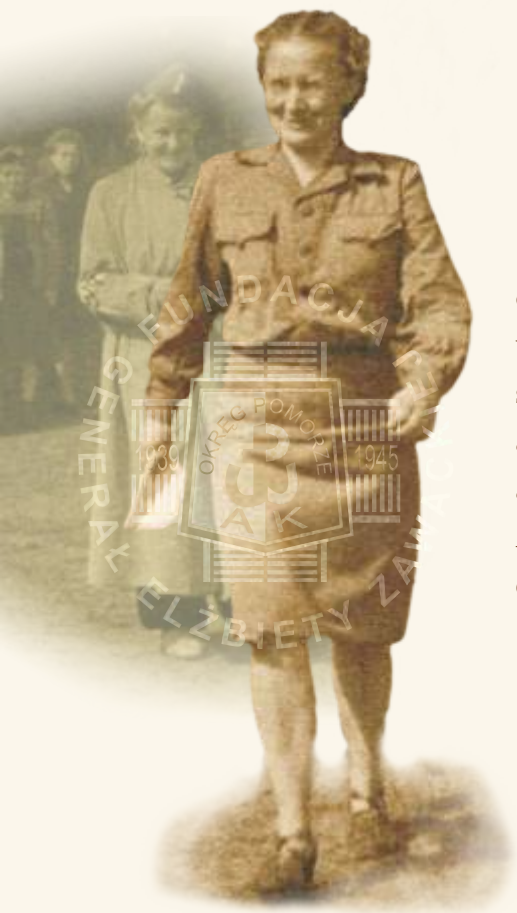
◀ Garczyn 1946

Having been demobilized, Zawacka returned to Toruń. However, due to the political situation in the country, she did not stay long in Toruń and after a week she left for Warsaw. In the capital, she renewed her underground contacts and got involved in independence activities in the Delegation of the Armed Forces in the department of communication and distribution of the Western Area. She also worked in the distribution of the brochure of the