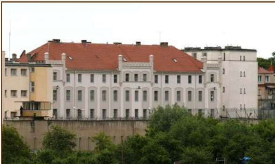
▲ Prison in Fordon

kept in a cell with eight other prisoners. She went through a ruthless investigation. Accused of harmful activities for the Polish state, she was sentenced by the Military District Court in Warsaw first to 5 years in prison (sentence of 23 January 1952), and after the review of the verdict – at the request of the military prosecutor's office – upon the decision of the District Court – for 7 years (28 July 1952). After another review, she was sentenced to 10 years in prison (28 November 1952). On 12 December 1952, after a year and a half of