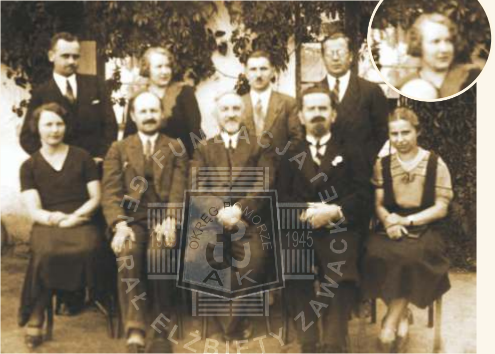
▲ Teaching Staff in the Middle School in Sempolno, the first half of the 1930s (the collections of the Foundation)

on the newly founded academic regiment of the PWK. She went there out of curiosity. She gave herself completely to the work at the PWK, whose aim was to train Polish women in the event of the outbreak of another war. In July 1931, she went to the PWK training camp to Garczyn near Kościerzyna (near Gdańsk), where she passed the initial PWK instructor course. In September she took a job in the six-grade co-educational German Junior High School under the name of Emil Kaschube in Sompolno (Koło county, Łódź province). She taught mathematics, physics and physical education there. She founded a PWK regiment in nearby Koło. She also completed higher instructor courses. She continued to teach at the Sompolan school for three years until the school was closed down. Then she took up the position of a teacher at the Scientific and Educational Center of the Ursuline Sisters in Otorowo (Poznan province). She continued to engage in the work for the PWK. In nearby Szamotuły, she replaced the commander of the PWK regiment, who was delegated to a higher instructor course. At the